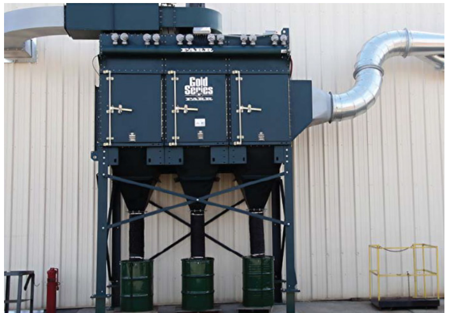
GS24 on laser cutting for carbon and stainless steel

Jeff Pittenger of Effective Controls represented Camfil APC and worked with E&E to develop a dust collection system that would work with excellence and allow for future growth.