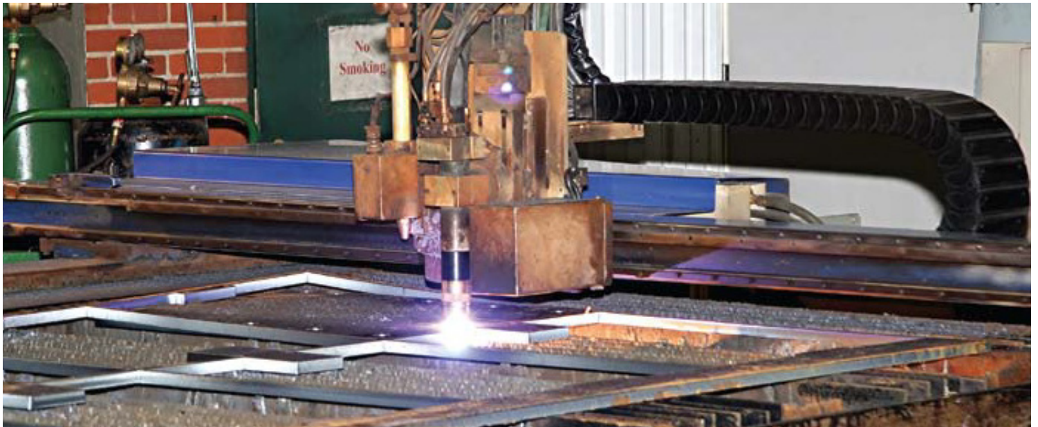
A GS24 was selected for the application, as its capability allowed for expansion.

For further information regarding this application, contact filterman@camfil.com .