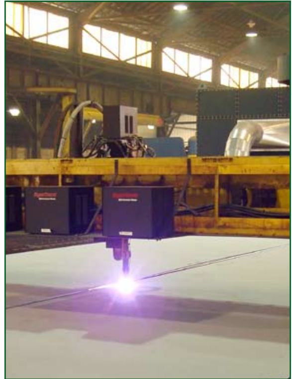
Plasma cutting on a downdraft table.

It was determined that the decision to go with this custom designed downdraft system, the savings would pay for the new Universal Torch & Equipment downdraft system in approximately 18 months after taking all factors into consideration. Added benefits are the virtual elimination of dust/smoke problems produced by the plasma cutting and safeguarding the health of the workers. ➤