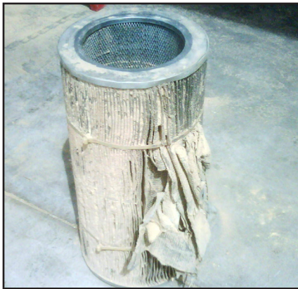
Competitor's cartridge "blown out" under the pressure.

Product: HemiPleat ® Size: 24 Retrofit Cartridges on Competitors Unit Application: Wood Customer: Showerama - Australia Representative: Air Pollution Control