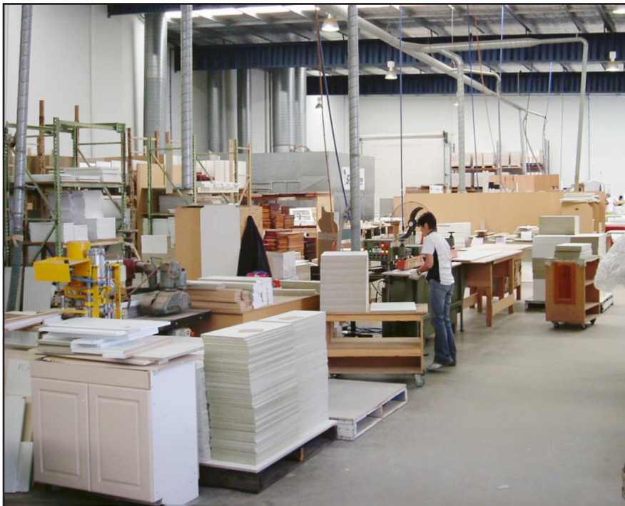
Wood working application at Showerama in Australia