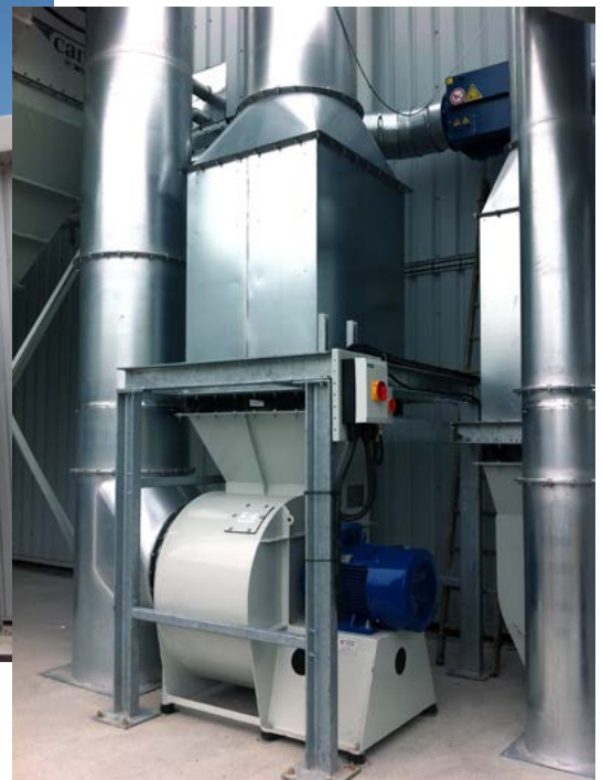
High efficiency fan fitted with discharge silencer and controlled by a variable speed drive for energy savings.