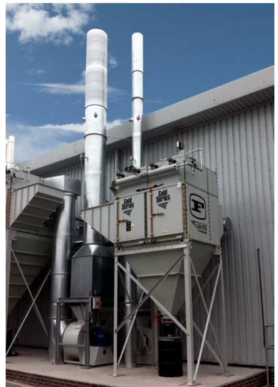
Farr Gold Series® GS12 installed to control process dust at Impreglon UK.

The solution proposed by Camfil APC had to handle the demanding requirements of Impreglon's applications, as well as being ATEX compliant.