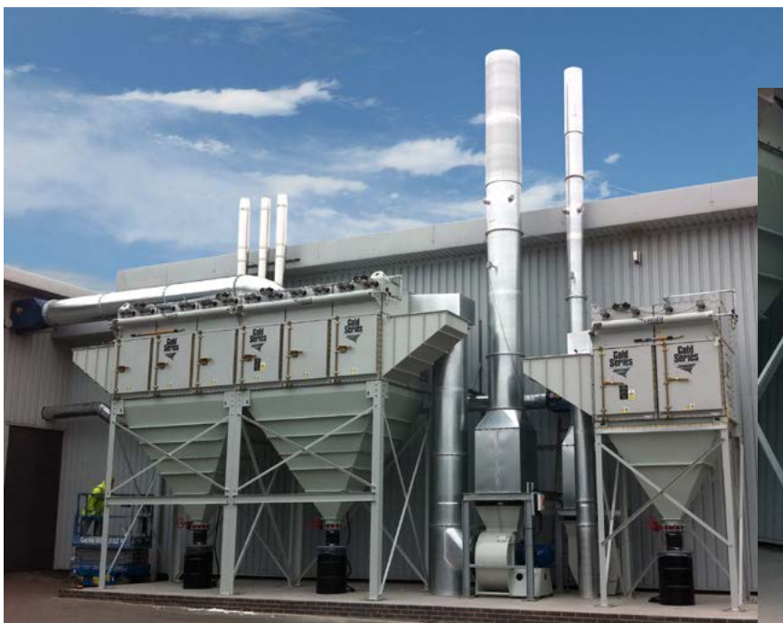
The GS48 and the GS12S installed outside the factory providing more space, less noise and a cleaner working environment.